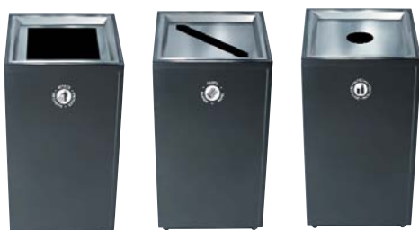
40 Gallon Unit/Top Configuration Options