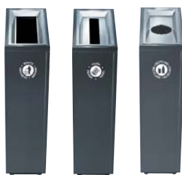
20 Gallon Unit/Top Configuration Options

Waste 11-1/16" x 11-1/16" opening Paper 2" x 15-5/8" opening Cans/Plastic/Glass 4-1/4" diameter opening