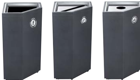
35 Gallon Unit/Top Configuration Options

Waste 4-1/4" x 13-3/16" opening Paper 2" x 12" opening Cans/Plastic/Glass 4-1/4" diameter opening